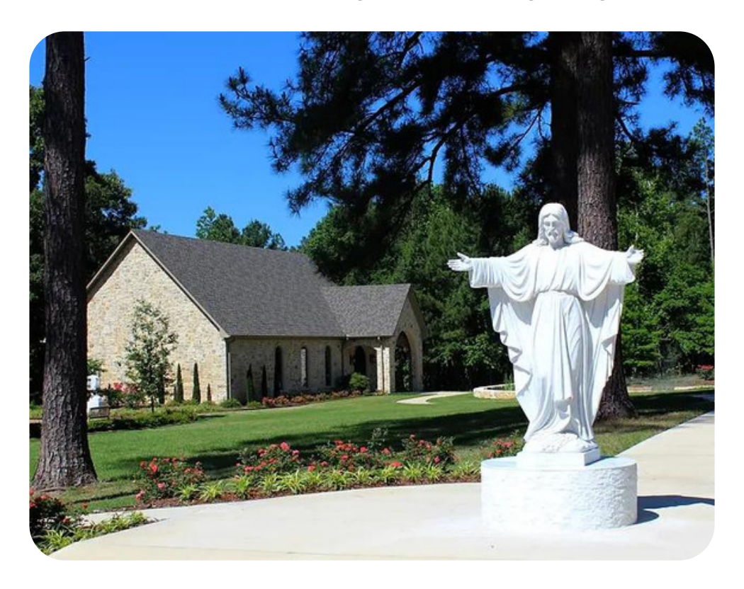
"Be still and know that I am God" Psalm 46:10

This was truly an event for the books and I hope we get to come back together again soon!